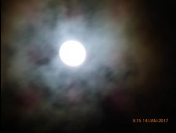
The moon in front of the clouds